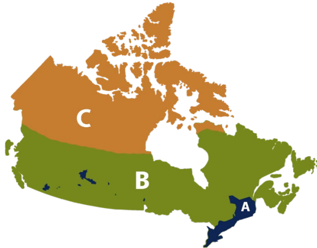
Canada Export Zones

From the US UPS eFulfillment centers, you can ship to Canada using either Canada Exports 1-2 Day service or Canada Export Standard service. A simplified three-zone rate structure helps you easily find the service level and rate that works for you.